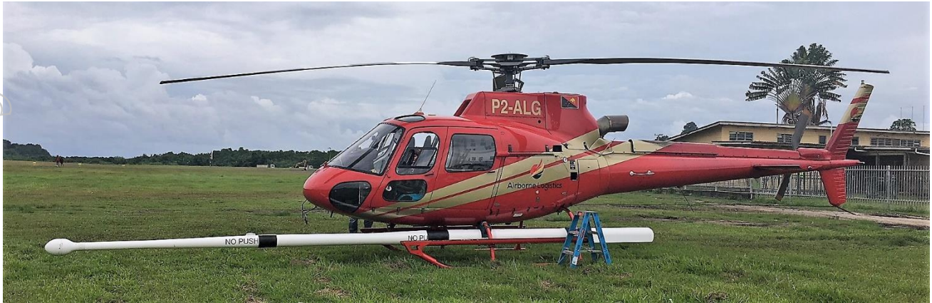
Airborne Logistics helicopter with Thomson probe at Buka Airport

Weather permitting, the data collection will be completed in September 2018 and the geophysical analysis reports are expected by mid-October 2018.